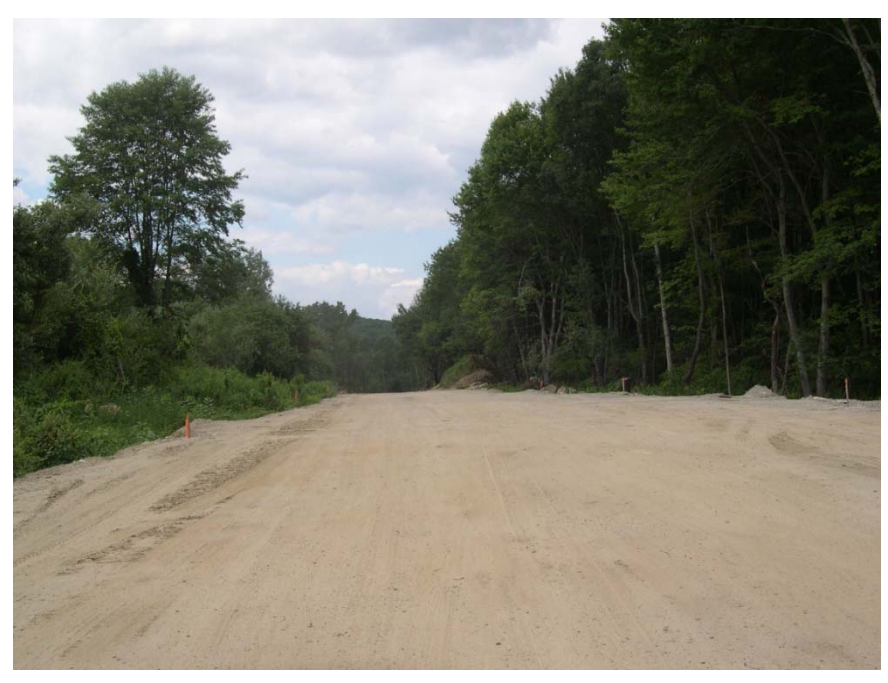
Roadway at Lots 1, 2 & 3