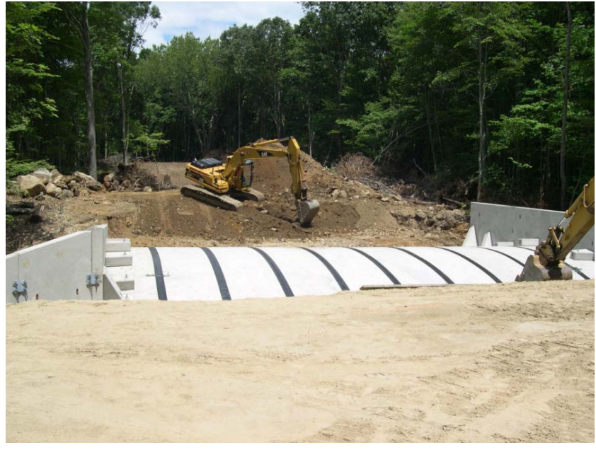
New Bridge - Technology Drive