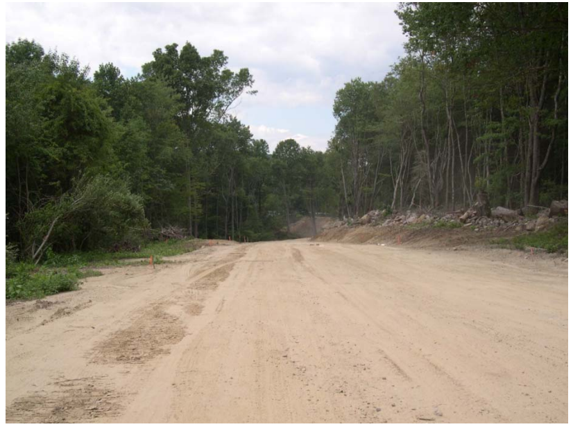
Roadway at Lots 10 & 4