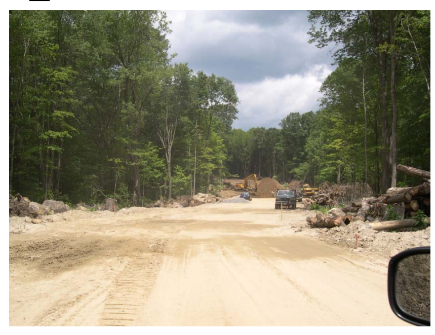
Roadway to the Bridge Open Space Entrance Left Lot 4 on the Right